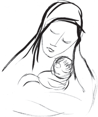
Drawing by Thomas Merton.

Mother Seton House PO Box 673 Fryeburg, ME 04037